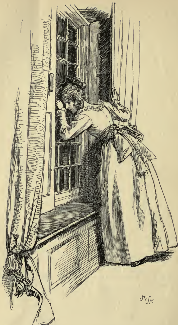
Opened a window-shutter.